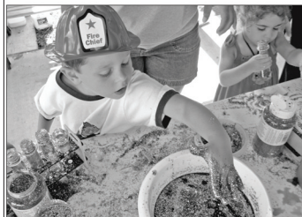
WHEN I GROW UP: The Parish School summer campers conduct experiments with color-changing gelatin in a science lab at the "When I Grow Up" fair Friday. During the event, the children had hands-on experience in such fields as art, writing, science and fire fighting.